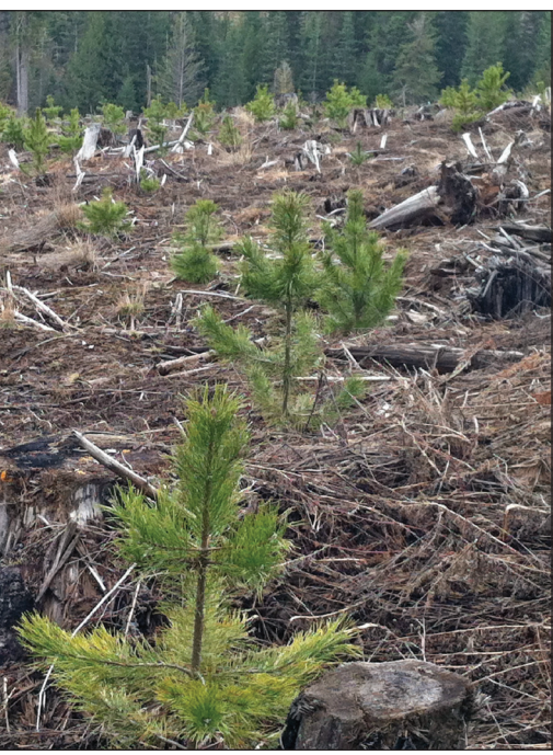
March 1, 2016 Coeur d'Alene Resort Coeur d'Alene, ID